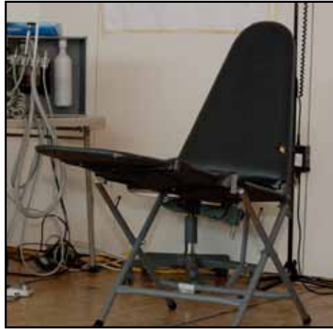
This chair is one of two original chairs purchased when Miles of Smiles launched in 2002 that need to be replaced.

Each of our four chairs is sterilized between every patient. After seven years supporting thousands of children during dental examinations and procedures, this valuable equipment is beginning to show its age. The cracking and patched holes make them more difficult to clean, eating up valuable time during visits to local schools.